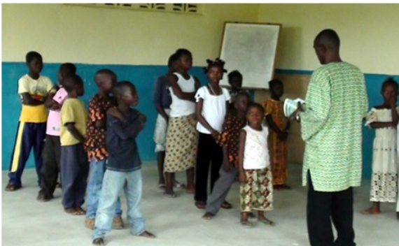
Left: Scripture memory practice