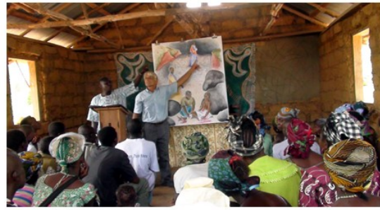
Teaching on the Good Samaritan. Attitudes, facial expressions, and body language are universal and they all got the lesson.